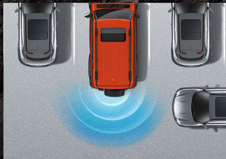
Rear Cross Traffic Alert (RCTA) Rear Cross Traffic Braking (RCTB)