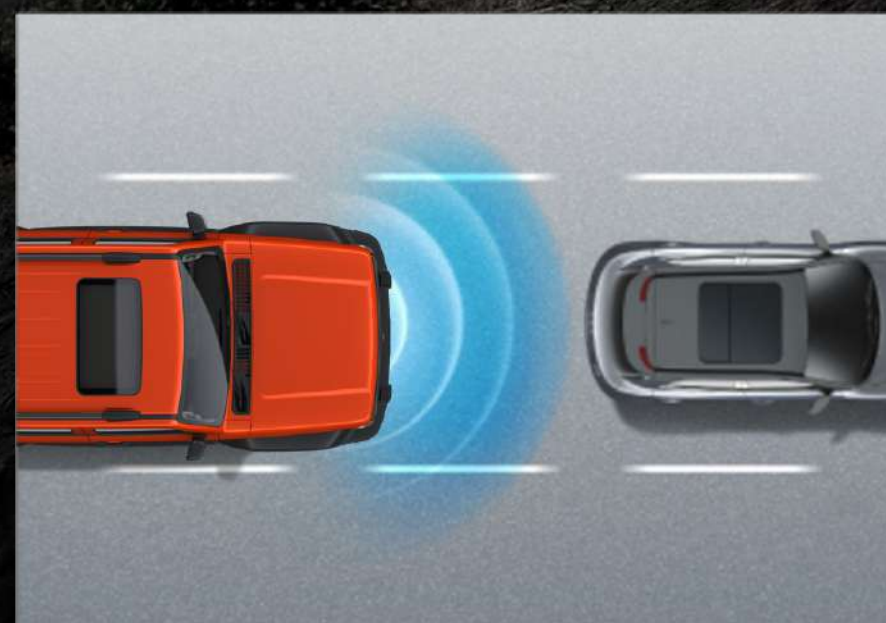
Auto Emergency Braking + Intersection (AEBI) Maneuver Emergency Braking (MEB) Front Collision Warning (FCW)

ALL NEW GWM TANK 300, the epitome of engineering assurance. Ensures confidence with comprehensive safety technology, safeguarding you and your travel companions throughout the journey.