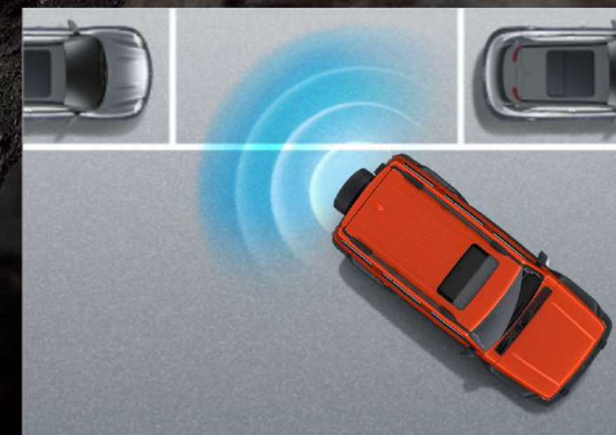
3 types of Integration Intelligent Parking (IIP)