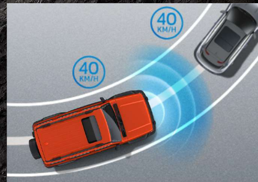
Adaptive Cruise Control with intelligent cornering (Intelligent ACC) Intelligent Curve Control (ICC) Traffic Jam Assist (TJA)