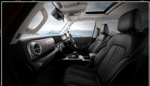
ULTRA / Black