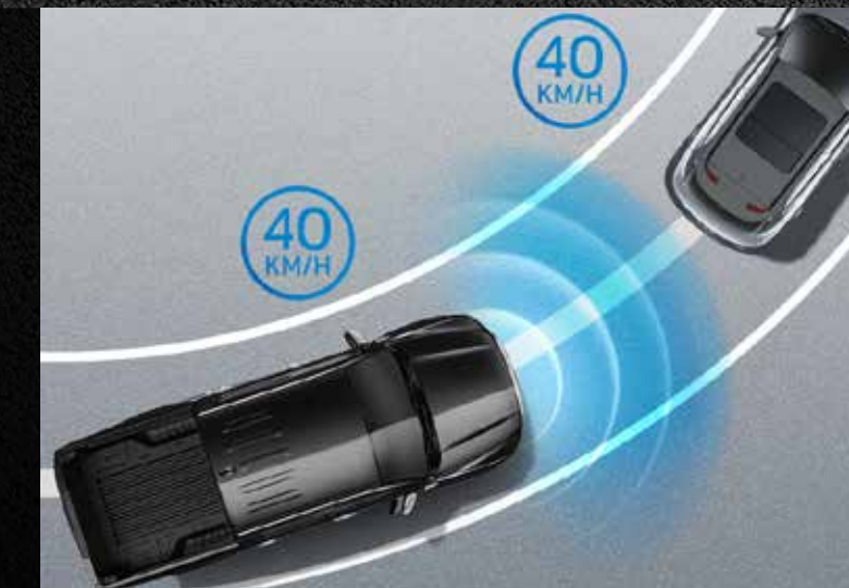
Adaptive Cruise Control with intelligent cornering ( Intelligent ACC ) Traffic Jam Assist ( TJA )