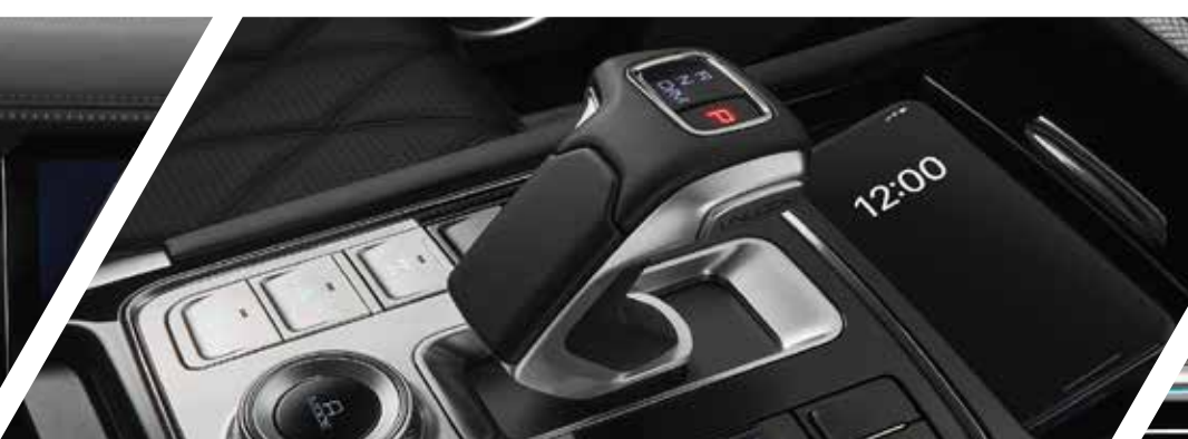
Electronic Shifter 9-speed automatic transmission, special design.