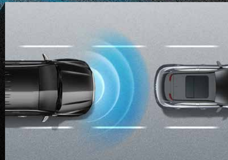
Auto Emergency Braking and Intersection ( AEBI ) Front Collision Warning ( FCW )