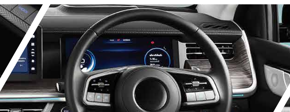
Multi-Function Steering wheel easy to control with one tip.