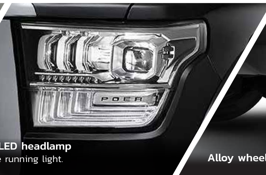
Intelligent LED headlamp with Daytime running light.