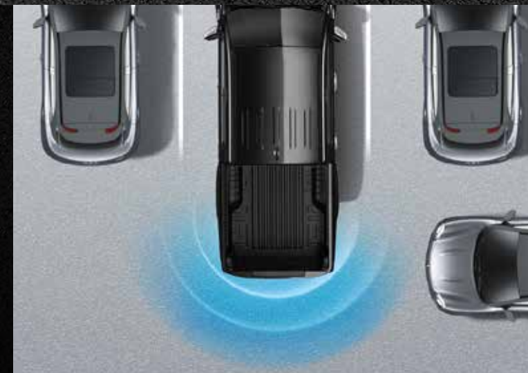
Rear Cross-Traffic Alert ( RCTA ) Rear Cross-Traffic Braking ( RCTB ) Rear Collision Warning ( RCW )