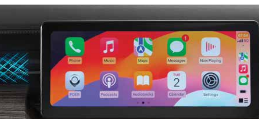
12.3" Entertainment & Control Display with Apple Carplay® and Android Auto.

Fulfill the perfection of the design through the unique design Luxurious, comes with the most functional to meet all your driving lifestyles.